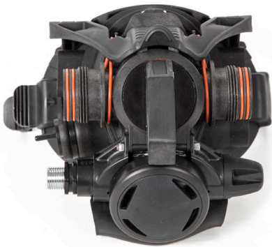
BAILOUT OPEN CIRCUIT

The main purpose of the open circuit Switchover Regulator is to give the diver the option of switching to an alternate off the loop gas supply. This is done without removing the Pod by simply rotating the Barrel Valve Handle to the vertical position. This will get the diver off the closed circuit breathing loop and immediately on to a known offboard open circuit gas.