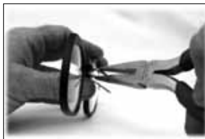
Or a Pliers to Lower the Frames

Note: Some slight adjustments can be made to the positioning of the frames if needed.