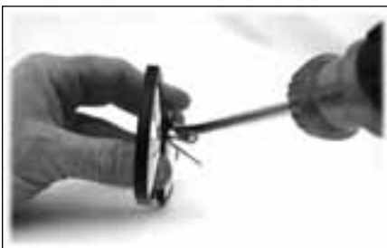
Use a Screwdriver to Raise the Frames

3. Next mount the Lens Retainer onto the Oral Nasal by insert the "legs" of the Mount Wire into the receiving holes located on top of the nose area of the Oral Nasal (510-747).