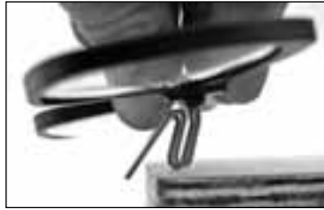
Push against a firm surface until you feel a "click"

2. Once the Lenses have been installed, attach the Mount Wire, P/N 530-923 onto the Retainer Frame, P/N 520-538 by inserting it into the slot on the front of the Frames.