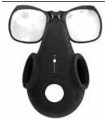
510-747 Oral Nasal

3. Next mount the Lens Retainer onto the Oral Nasal by insert the "legs" of the Mount Wire into the receiving holes located on top of the nose area of the Oral Nasal (510-747).