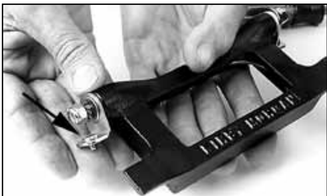
Install the screws through the mount ears.

mask, install and tighten the two mount screws into the port retainer ears.