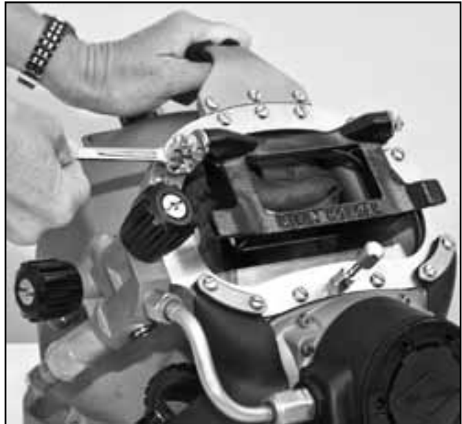
Tighten the weld lens assembly.