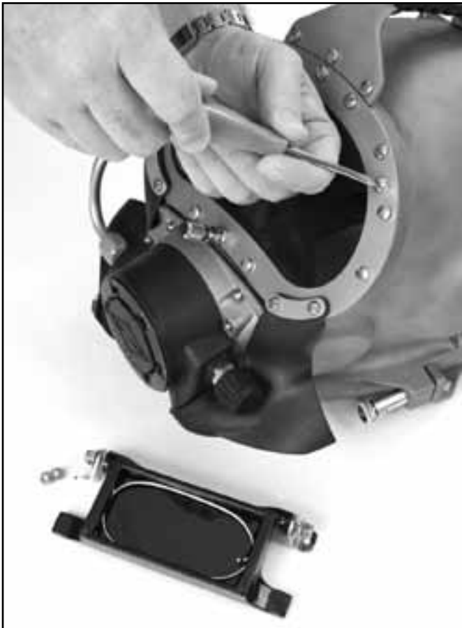
Remove the two plug screws from the port retainer.

3) With the shield facing out from the helmet or