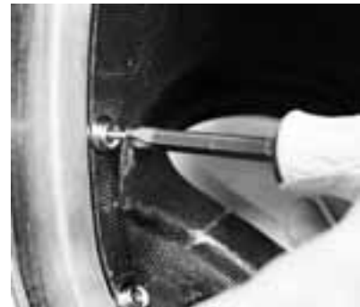
Fig: 1 A